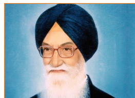
Surjit Singh Barnala (1985-87)