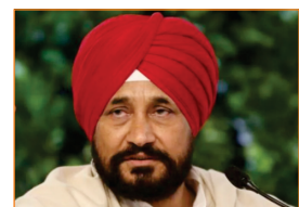
Charanjit Singh Channi (2021-22)