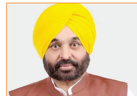
Bhagwant Mann (2022-Present)

Here are the chief minister of Punjab after the Punjab Reorganisation Act which was passed on 18 September 1966.