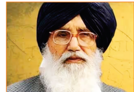
Prakash Singh Badal (1970-71, 1977-80, 1997-2002, 2007-12, 2012-17)