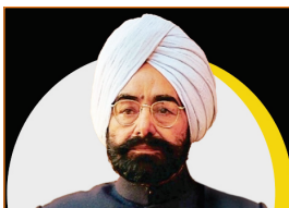
Giani Zail Singh (1972-77)